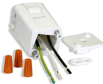
White Track Adapter (TP231)