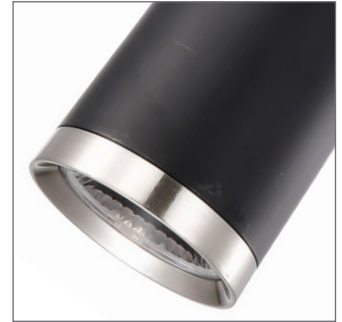
Matte Black/Brushed Nickel (62-829)