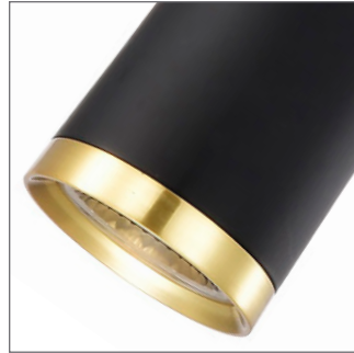
Matte Black/Brushed Brass (62-828)