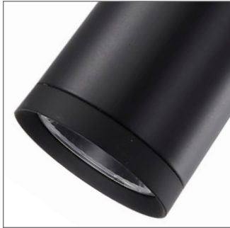
Matte Black (62-826)