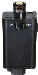
Black Track Adapter (TP232)