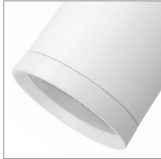
Matte White (62-827)